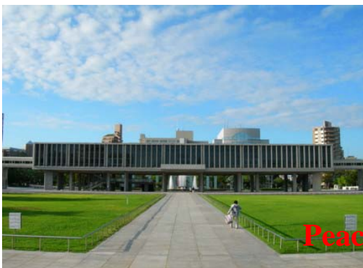
Peace Memorial Park